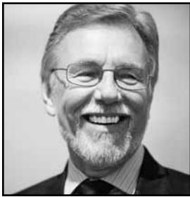
Message from the Chair

The Global Transportation Hub (GTH) is a major economic initiative for the Province of Saskatchewan that will serve to fuel the continued growth and strength of our economy, through the attraction of new investment and the provision of enhanced global supply chains for Saskatchewan importers and exporters. The GTH will also create new jobs and opportunities for Saskatchewan-based businesses.