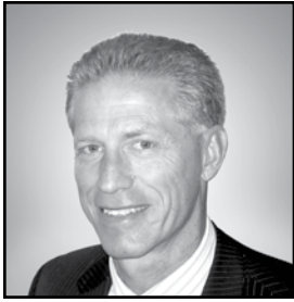
Message from the CEO

The Global Transportation Hub Authority (GTHA) is the lead agency responsible for planning, developing, constructing and promoting the Global Transportation Hub (GTH). The GTH has worked hard to create a lean operating structure that is efficient and supports the needs of partners and co-locators.